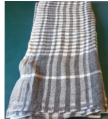
LQC020 £16 Scarve made with fine wool.