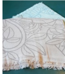
LQF012 £15 Scarf made with bamboo yarn