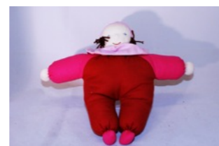
TC014 £7.50 +p&p