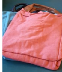
LQC001 £22 Bag made from cotton with faux leather handles