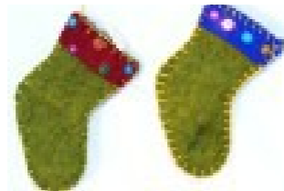
XF002 £1.75 +p&p