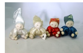
TC007 £2.50 +p&p