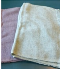
LQC017 £9 scarf from Banana Yarn