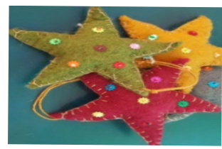
XF006 £1.50 +p&p