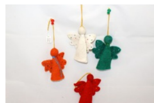
XF003 £1.75 +p&p