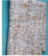
LQC023 £22 Scarf in the round made with Yak & silk