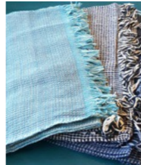
LQC18 £8 Cotton scarf