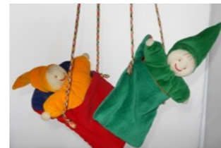
TC001 £4.00 +p&p