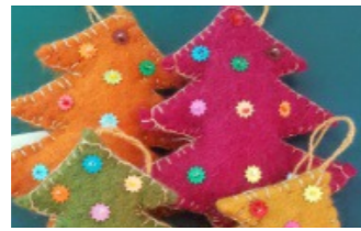
XF008 £1.75 +p&p