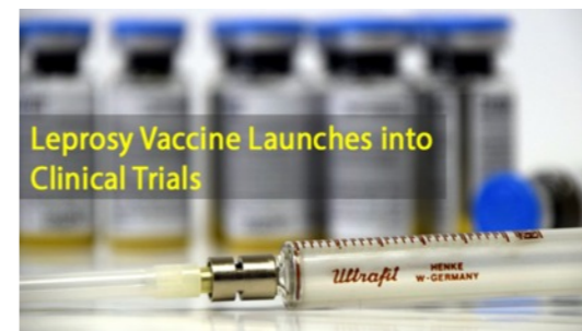
Leprosy Vaccine Launches into Clinical Trials

For decades, scientists have been trying to develop a vaccine that can be used to prevent leprosy, but it has proved very difficult. Despite leprosy being such an ancient disease, it is officially recognised as a neglected tropical disease. This is because the rich western world is no longer affected by it and so funds to research a vaccine have been hard to come by.