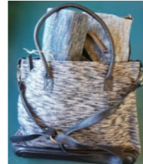
LQC004 £38 Cotton with leather trim