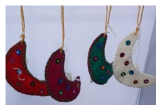
XF010 £1.75 +p&p