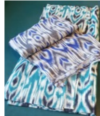
LQC019 £16 Scarf made from fine wool