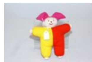
TC006 £3.50 +p&p